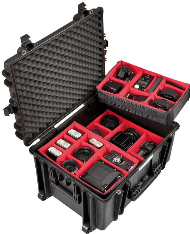
Photo cases made in injection molded PP material. Equipped with three padded dividers sets to store professional camera gears.