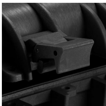
JAM FREE LATCHES WITH EASY-OPENING MECHANISM

Internal slots for optional panel mounting brackets or panel mounting rings