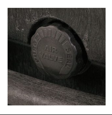
MANUAL PRESSURE RELEASE VALVE The internal stop ring prevents valve from being completely extracted (Art. PURGEVALVE.B)