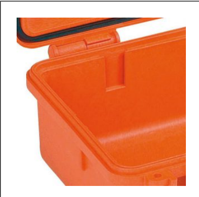
INTERNAL SLOTS Internal slots for optional panel mounting brackets or panel mounting rings