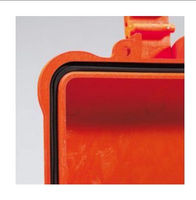
SEALING O-RING (Art. NEOSEAL + nr. art.)