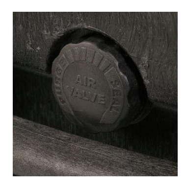
MANUAL PRESSURE RELEASE VALVE The internal stop ring prevents valve from being completely extracted (Art. PURGEVALVE.B)