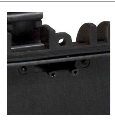
FIXING POINTS Additional fixing points on the lid, available on certain models