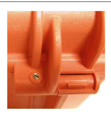
LID CAN BE SET TO SLIDE-OFF By releasing the back screw, lid becomes set to slide-off when opened at 70°