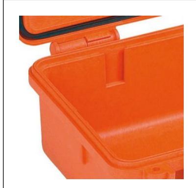
INTERNAL SLOTS Internal slots for optional panel mounting brackets or panel mounting rings