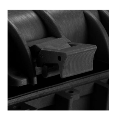
JAM FREE LATCHES WITH EASY-OPENING MECHANISM (from model 3818 on)