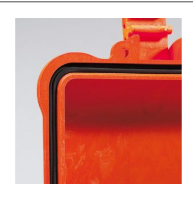
SEALING O-RING (Art. NEOSEAL + nr. art.)