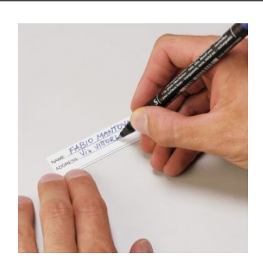
PVC WATERPROOF I. D. REMOVABLE LABEL (Art. LABELCOVER + nr. art.)