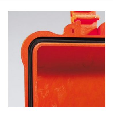
SEALING O-RING (Art. NEOSEAL + nr. art.)