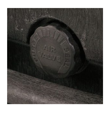
MANUAL PRESSURE RELEASE VALVE

The internal stop ring prevents valve from being completely extracted (Art. PURGEVALVE.B)