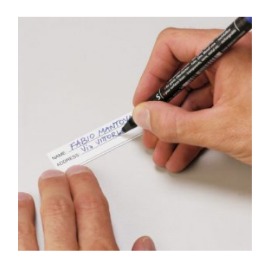
PVC WATERPROOF I. D. REMOVABLE LABEL (Art. LABELCOVER + nr. art.)

The internal stop ring prevents valve from being completely extracted (Art. PURGEVALVE.B)