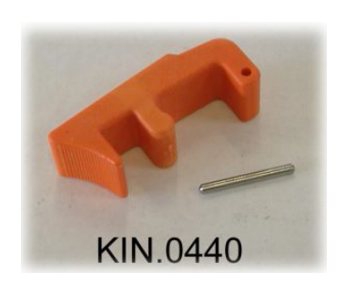
Latch for models from 1908 to 2214