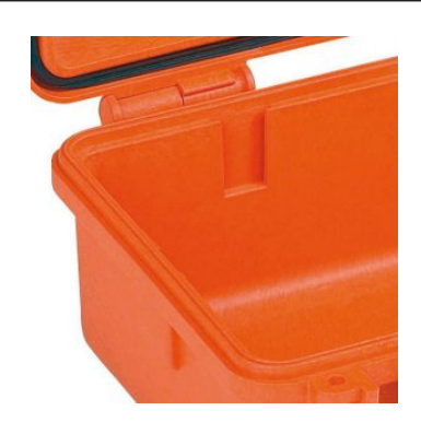
INTERNAL SLOTS Internal slots for optional panel mounting brackets or panel mounting rings