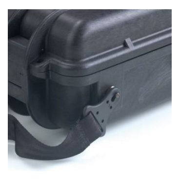
OPTIONAL SHOULDER STRAP (universal) (art. SHOULDERKIT.U)