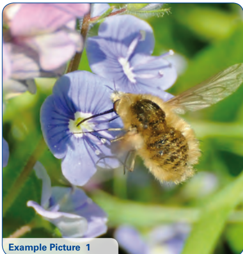
Example Picture 1