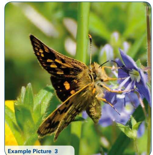
Example Picture 3