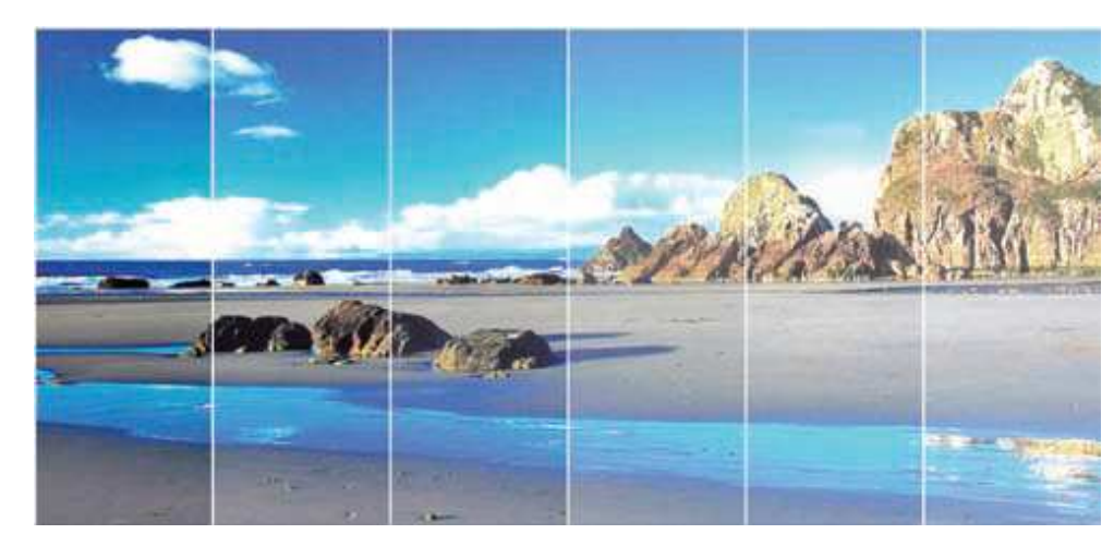
BRAUN SMOOTH ND-VARIO Selected Light Volume Levels